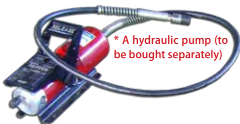
* A hydraulic pump (to be bought separately)

* A 3/8" female coupler is provided as a standard attachment. A coupler mismatch may prevent a valve from opening. In such a case, please replace the coupler with one recommended by the pump manufacturer.