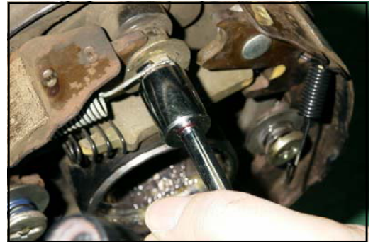
↑ Removing tension spring