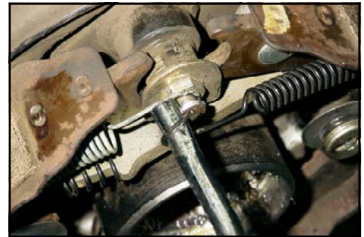
↑ Installing tension spring