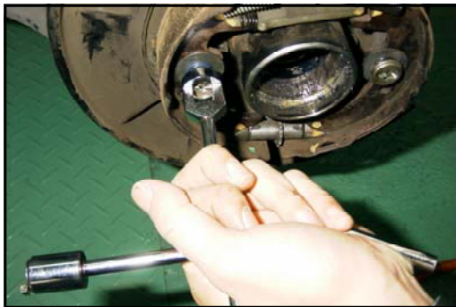
↑ Inserting and removing shoe hold spring