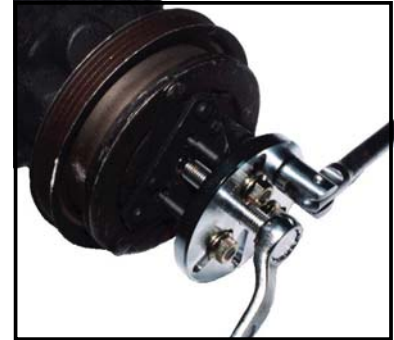
Removing the 3-hole type without tap (Zxcel)