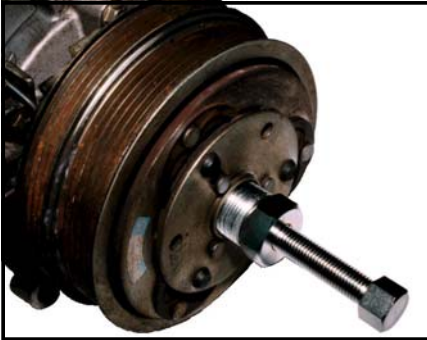
Removing the center tap type clutch

The photo shows the components in the SP-70C set. The SP-70B set is the same except the claw for the round hole and the nut.