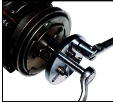
Removing the 3-tap type clutch