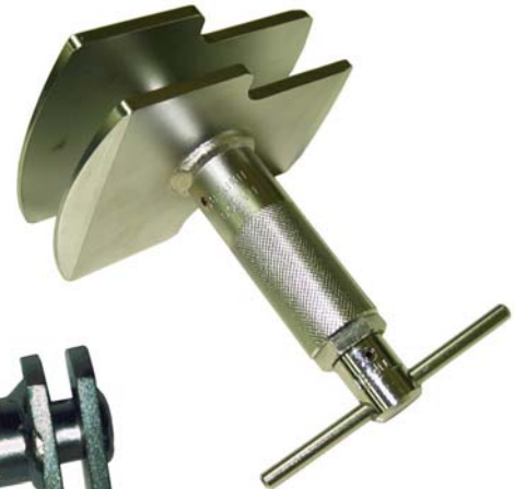
HDP-856T (for 4-pots and 6pots)